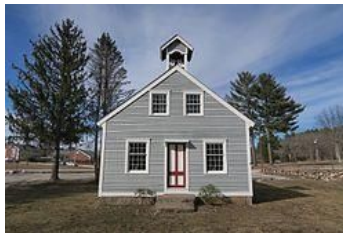
EXHIBIT at Bell School- “Driftways into Their Pasts”